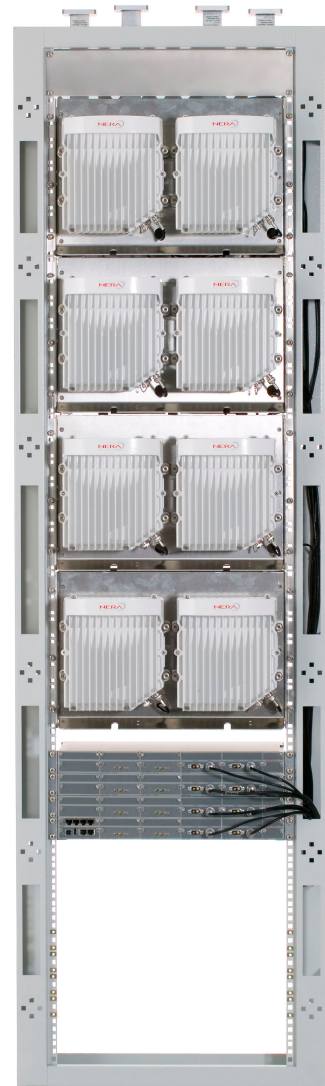
All Indoor Configuration

LOW POWER CONSUMPTION IS A WIN-WIN. SAVING THE ENVIRONMENT AND REDUCING NETWORK BACKHAUL OPEX