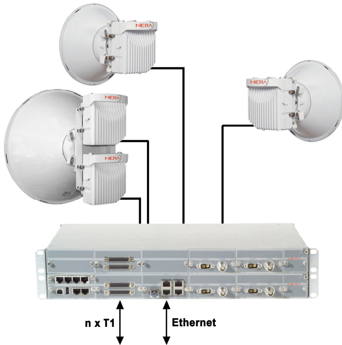
Split Mount Configuration